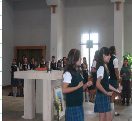
St. John of the Cross Crusader Choir

about the various service projects and fundraisers that there school conducted. They