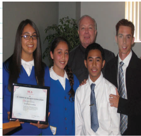
St. Charles Catholic School

also spoke of what it means to them to be a schools focused on Mission Spirituality. Many of the service projects and fundraisers were originally conceived and led by students. Hopefully, next year we will have even more schools apply for the award so it will be even harder to chose two winners. In this day of, "Me, me, me", it is refreshing and awe inspiring to see so many youth striving to go beyond there own lives and reach out to those living in